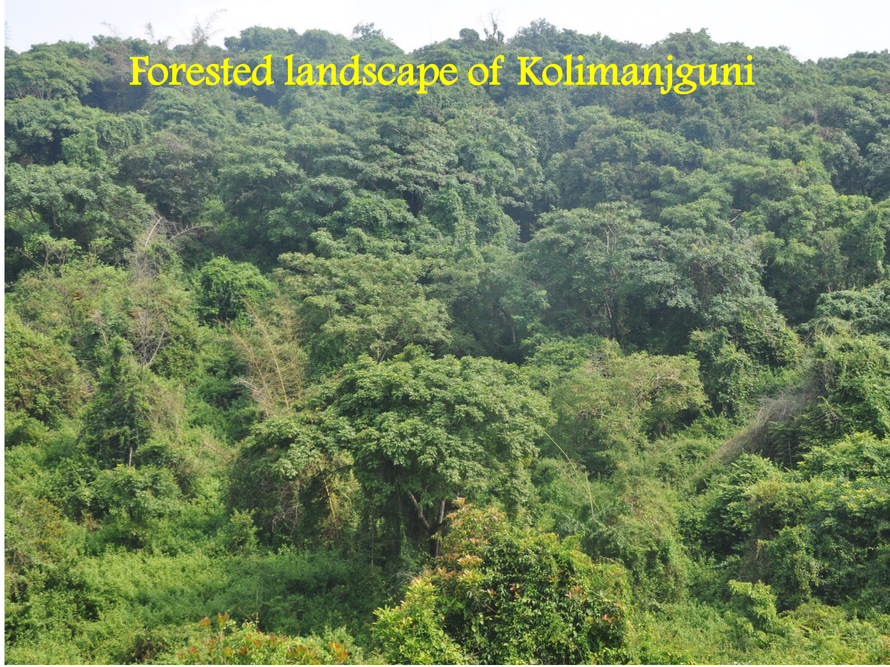
Forested landscape of Kolimanjguni

Kolimanjguni is a coastal village located in Kumta Taluk of Uttara Kannada District, Karnataka. Area of the village is about 336.86 Hectares with a population of 289 people (Census 2011). Rainfall in the village is about 3400 mm.